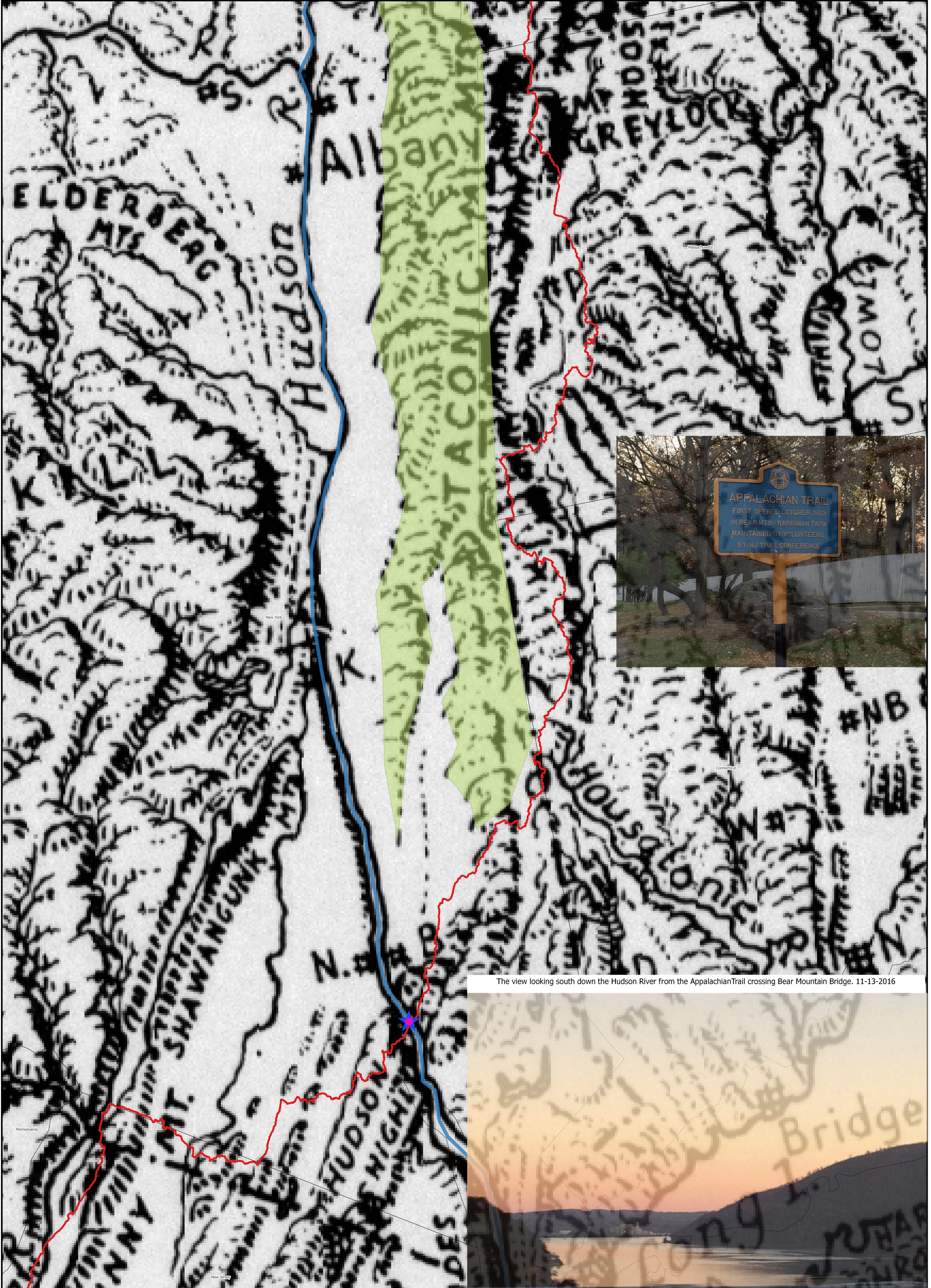
The view looking south down the Hudson River from the Appalachian Trail crossing Bear Mountain Bridge. 11-13-2016